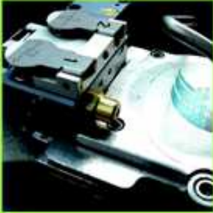
New cooling welding time indicator